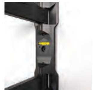
3 Attachment points and a built in level