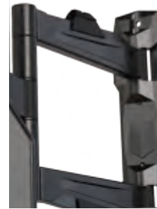
Decorative covers hide screw heads